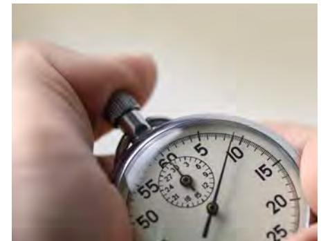
If you need another puff of medicine, wait 1 minute then repeat steps 5-9.