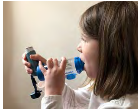
5. Close lips around mouthpiece