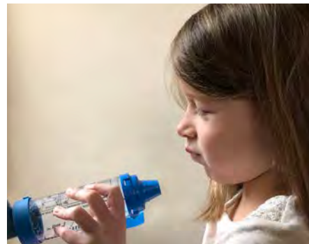
8. Hold your breath for 10 seconds if you can. Then breathe out slowly.