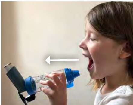
4. Breathe OUT all the way