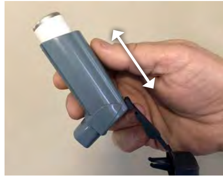
2. Shake the inhaler for 5 seconds