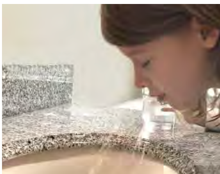
9. Rinse with water and SPIT OUT

For more asthma videos, handouts, tutorials and resources, visit Lung.org/asthma .