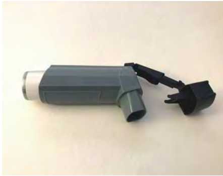
1. Take the cap off the inhaler