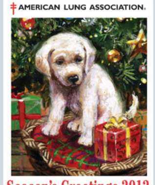
Season's Greetings 2012

Every gift to the American Lung Association counts, and makes a difference in the lives of those all around you. We make giving simple and encourage you to choose the way that suits you best. It's easy to donate online at www.Lung.org, and you'll know in an instant that your gift was received. You can donate through the mail or through our historic annual Christmas Seals® campaign, which has a festive new website: www.christmasseals.org. You can make a lasting gift through